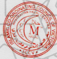
ICCV Halal Logo

ICCV is proudly accredited and recognised by: